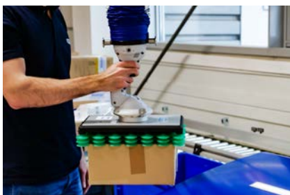
System design JumboFlex Mobile

Ergonomic handling thanks to the proven intuitive one-hand operation of the JumboFlex