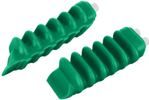
FINGER-SPARE-UNIT 6C IND