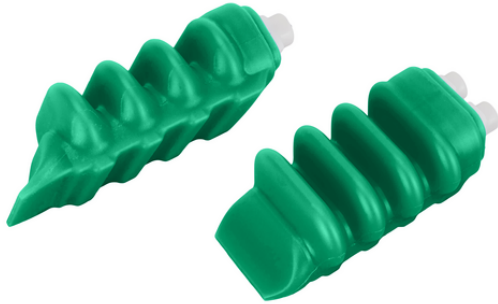
FINGER-SPARE-UNIT 4C IND