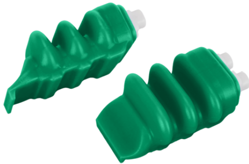
FINGER-SPARE-UNIT 3CA IND