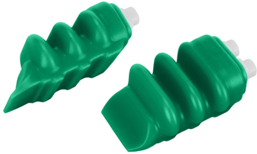
FINGER-SPARE-UNIT 3C IND