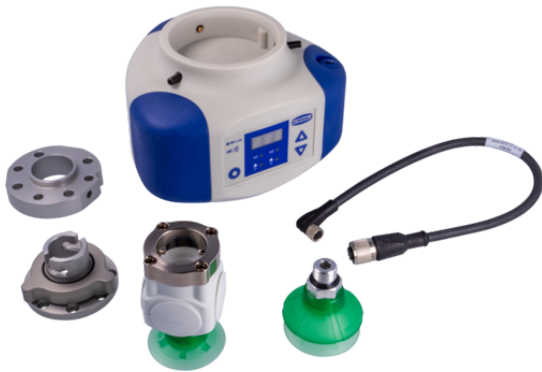
ROB-SET ECBPi FAIRINO

The handling set ECBPi is delivered unassembled. The delivery consists of: