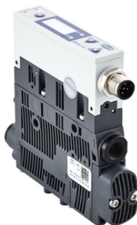
SCPSi BY 2-14 G02 NO M12-5