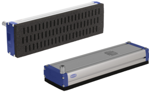
FA-Xc SVK 442 3R18 O20