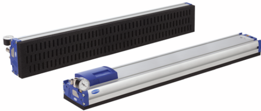
FXP-S-SVK 838 3R18 O10O10 F