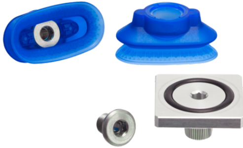
SAOXB 40x20 ED-85 RA MOD