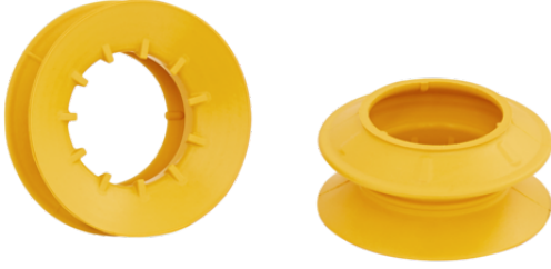
FLSA 40 NBR-ESD-55