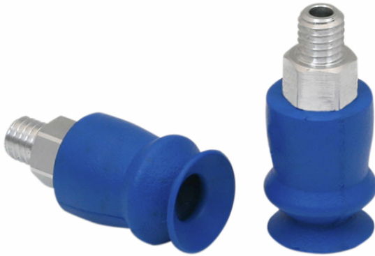
FSGA 11 HT1-60 M5-AG

Suction cup FSGA (elastomer part + connection nipple) is delivered unassembled (diameters of 33 mm and more are assembled). The delivery consists of: