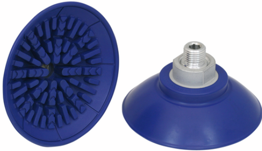
SAF 80 NBR-60 G1/4-AG

Suction cup SAF, available in various diameters, is delivered with connection nipple vulcanized to elastomer part.